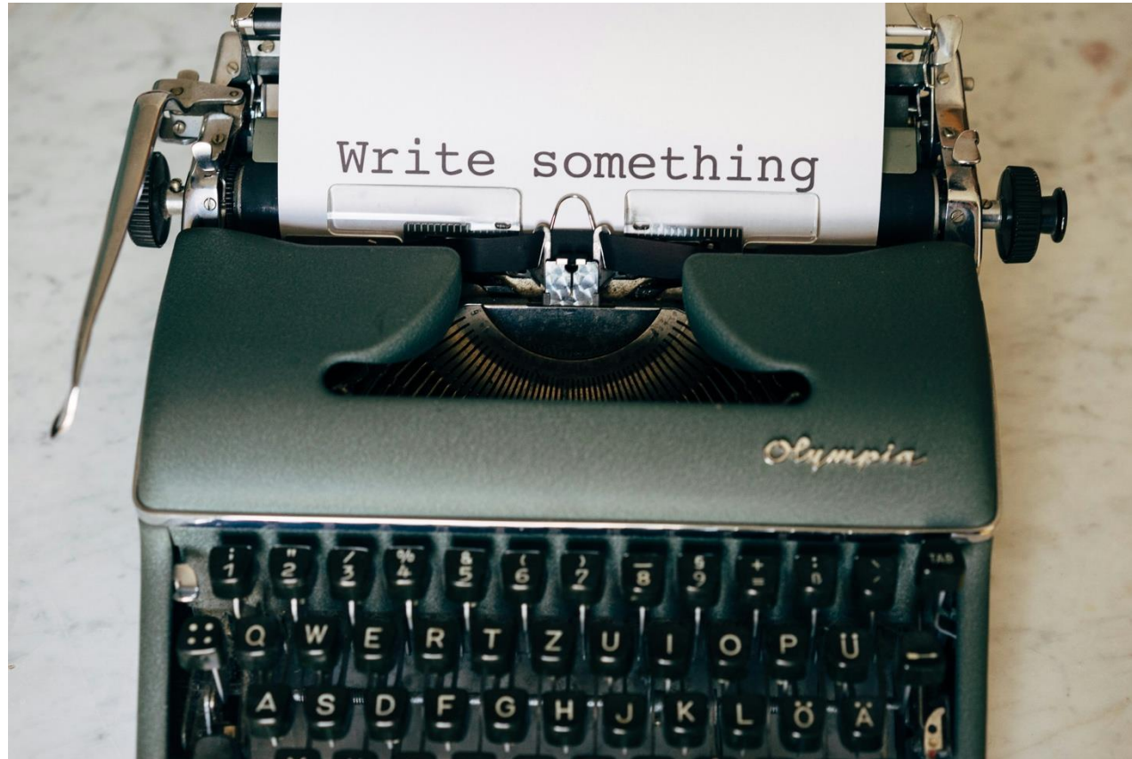
Course Moodle Site