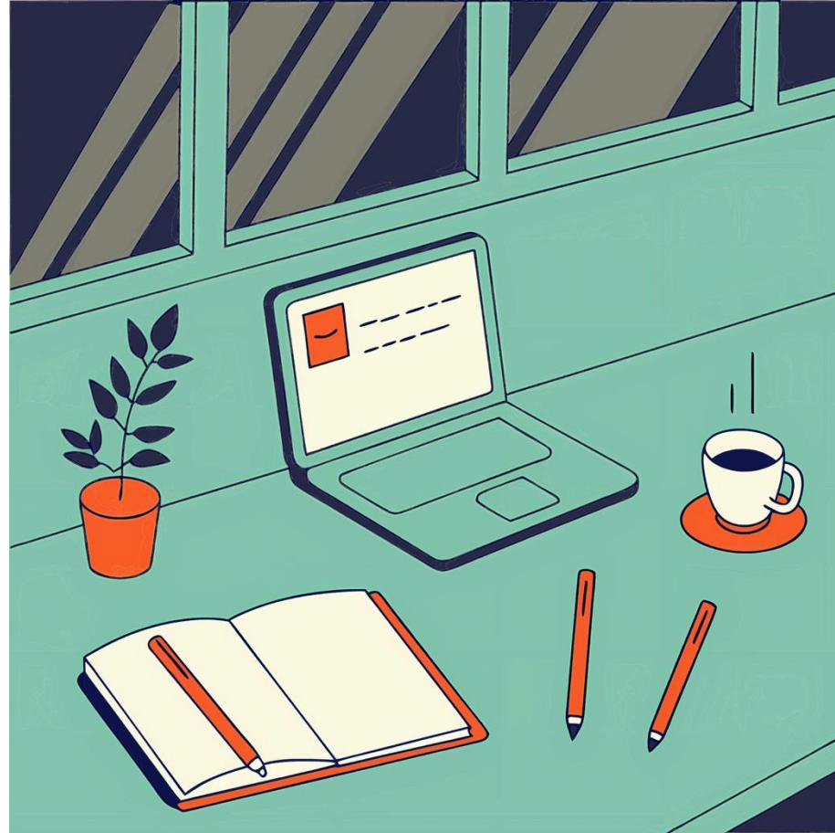
Illustration by Art Attack on Unsplash